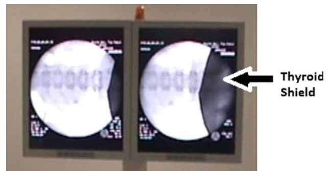
Fig. 1 Fluoroscopic appearance of thyroid shield at pelvic region